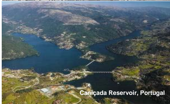
Caniçada Reservoir, Portugal