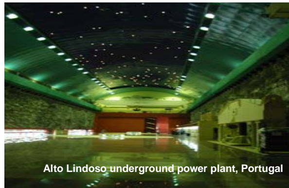
Alto Lindoso underground power plant, Portugal