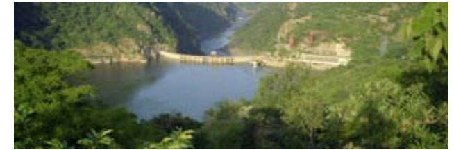
Cahora Bassa Dam, Mozambique