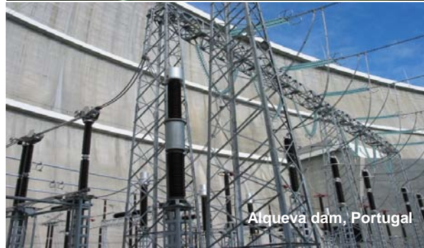
Alqueva dam, Portugal